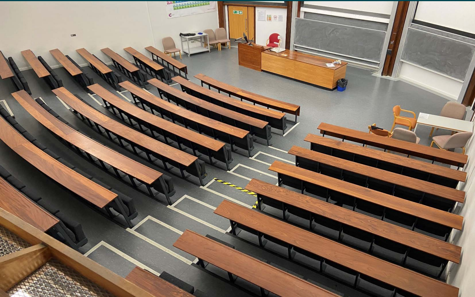
Lecture Theatre 1