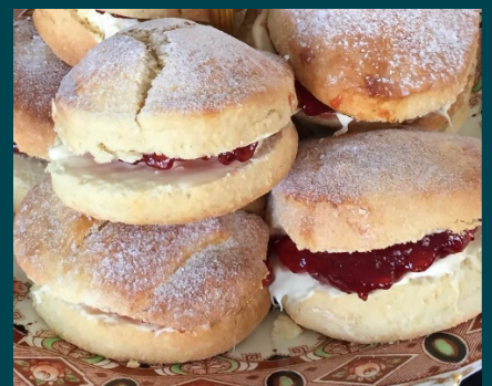
Wards Event Catering