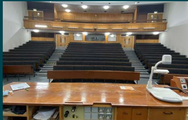
Lecture Theatre 1